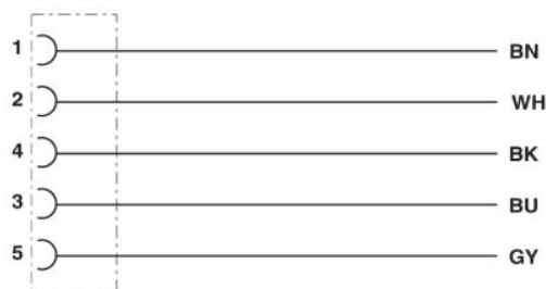
Contact assignment of the M12 socket